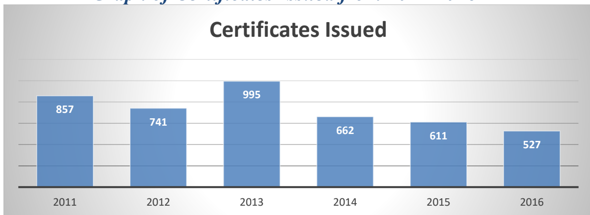
Graph of Certificates Issued from 2011-2016