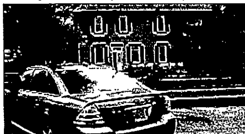
Several federal vehicles were seen in front of the Nervos Street group home Thursday, where investigators carried out boxes of "evidentiary" documents.