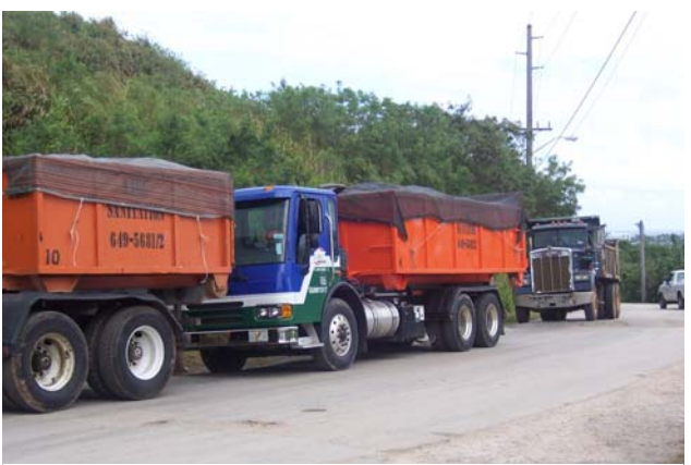
Image 3: Commercial hauler uncompacted solid waste dump trucks at Ordot Dump as SWM Technicians physically inspect the volume and compaction.

The OAG indicted<sup>9</sup> a commercial hauler in September 2006 on charges of conspiracy and bribery to dispose solid waste at the Dump for a reduced cost or at no cost. In March 2007, we transmitted a letter to the DPW Director recommending DPW secure a weigh scale using the proper procurement process and begin the development of the specifications. In April 2007, the DPW Director confirmed that the specifications for the weigh scale were completed and that they were currently in the process of preparing an invitation for bid (IFB) for the procurement of a weigh scale.