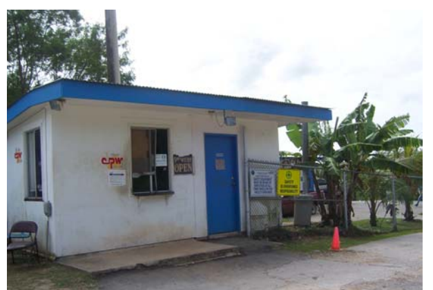
Image 2: SWM satellite office at the Ordot Dump where DPW manual charge invoices are prepared.

In our review of the billing cycle, we found several inconsistencies with how Solid Waste Tipping Fees field invoices (field invoices) are being processed. SWM technicians manually prepare and issue field invoices to commercial haulers upon entering the Ordot Dump (Dump). These field invoices consist of four copies. One copy is given to the