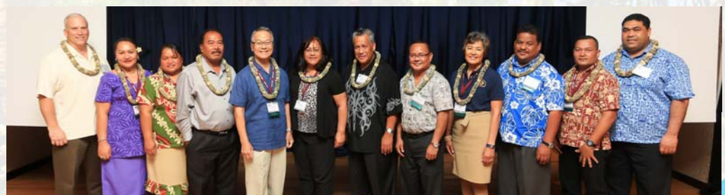
APIPA Principals and distinguished guests at the 2015 APIPA Conference.

We were pleased to host the 26 th Annual Association of Pacific Islands Public Auditors (APIPA) Conference in August 2015. Auditors and finance officers throughout Guam and Micronesia received valuable continuing professional education to help improve accountability and transparency and achieve good governance. The conference offered a wide range of ideas and courses, such as Audit, Government Finance, Grants Management, Leadership, and other courses to help professionals support and provide extended services to their organizations.